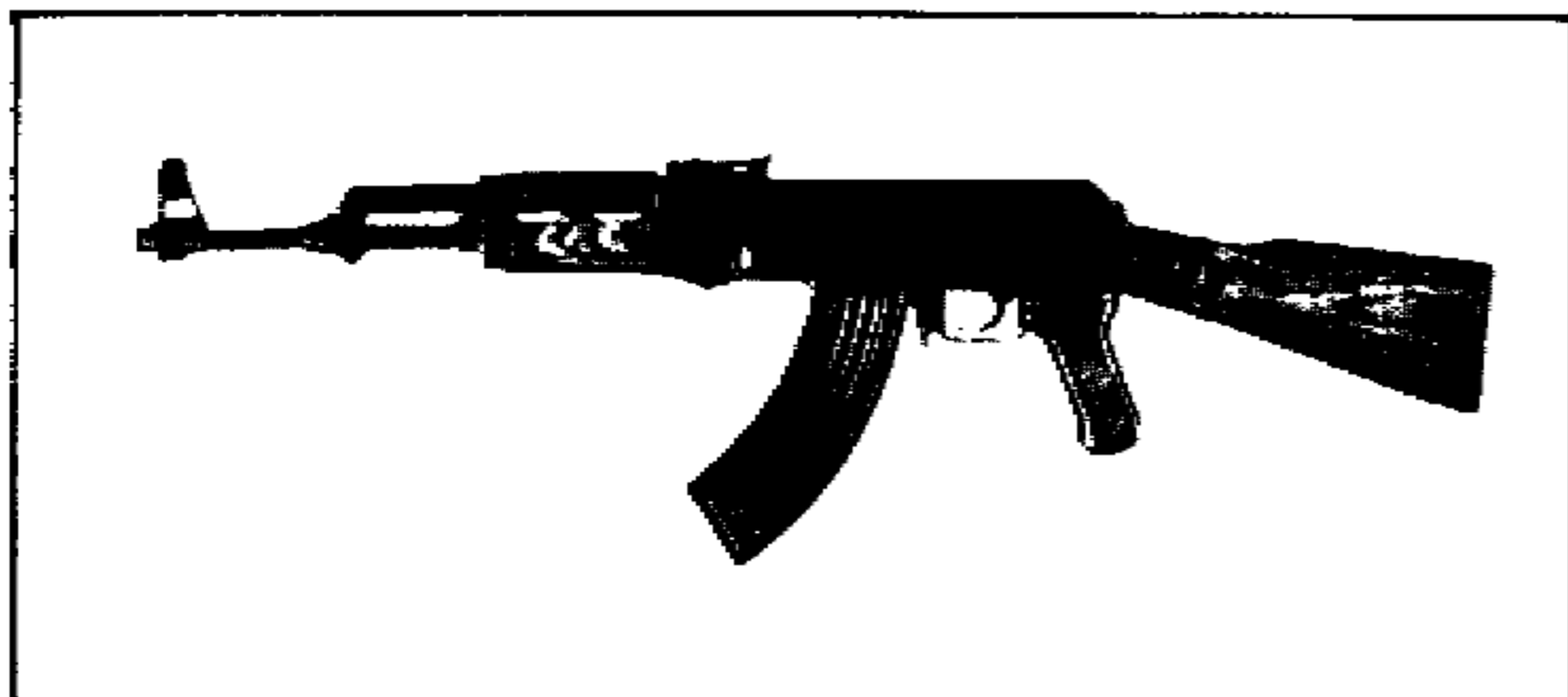
FIGURE 1. LEFT VIEW, AK-47