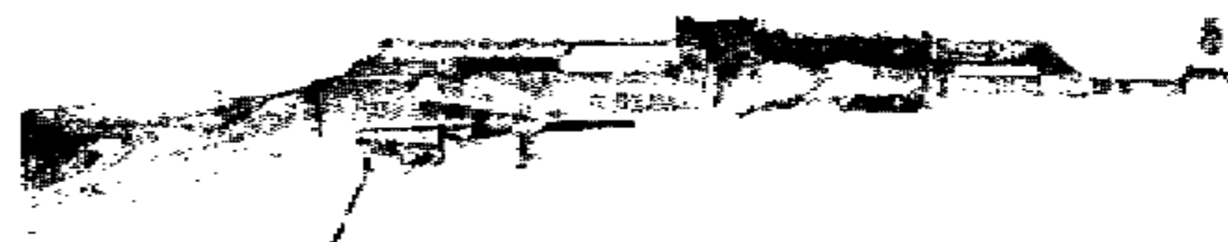
FIGURE 3. AK-47