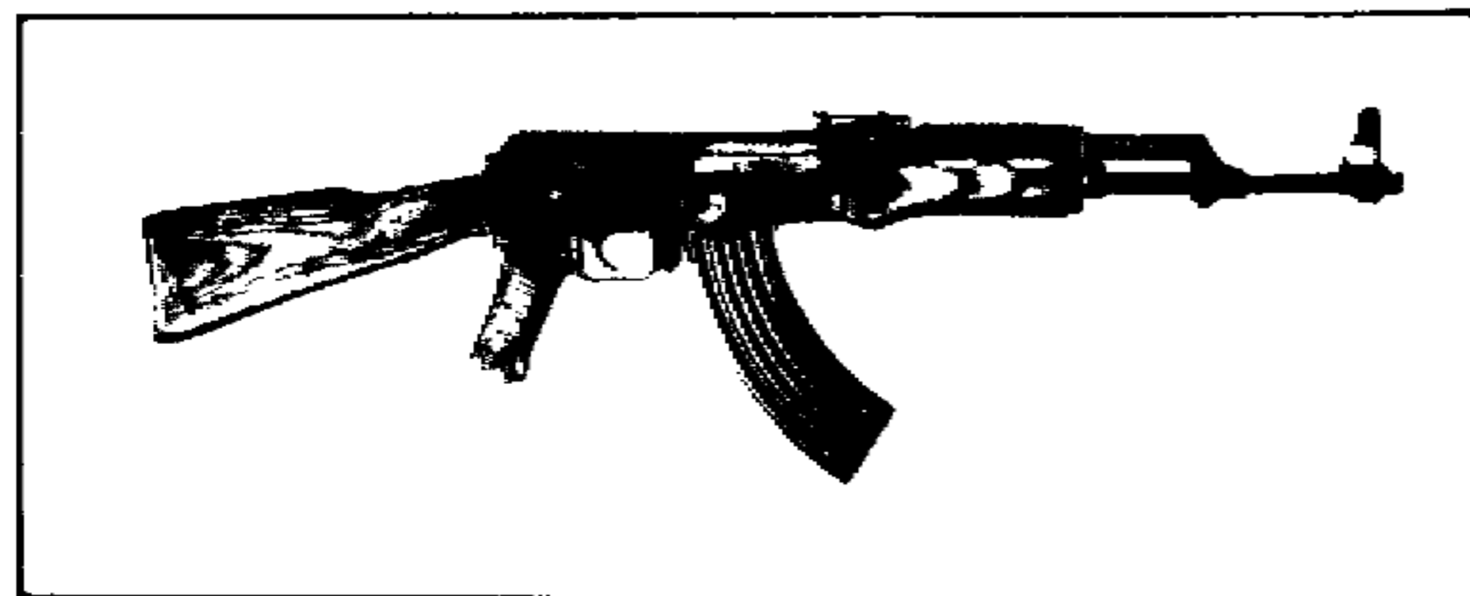
FIGURE 2. RIGHT VIEW, AK-47