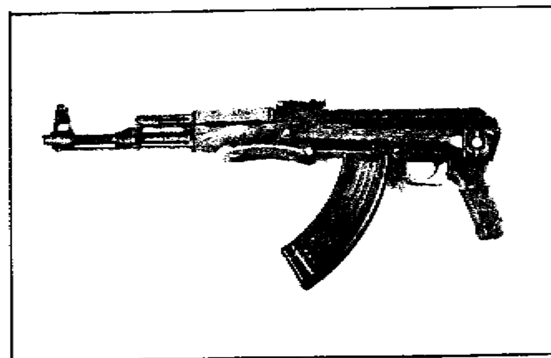
FIGURE 6. FOLDING STOCK