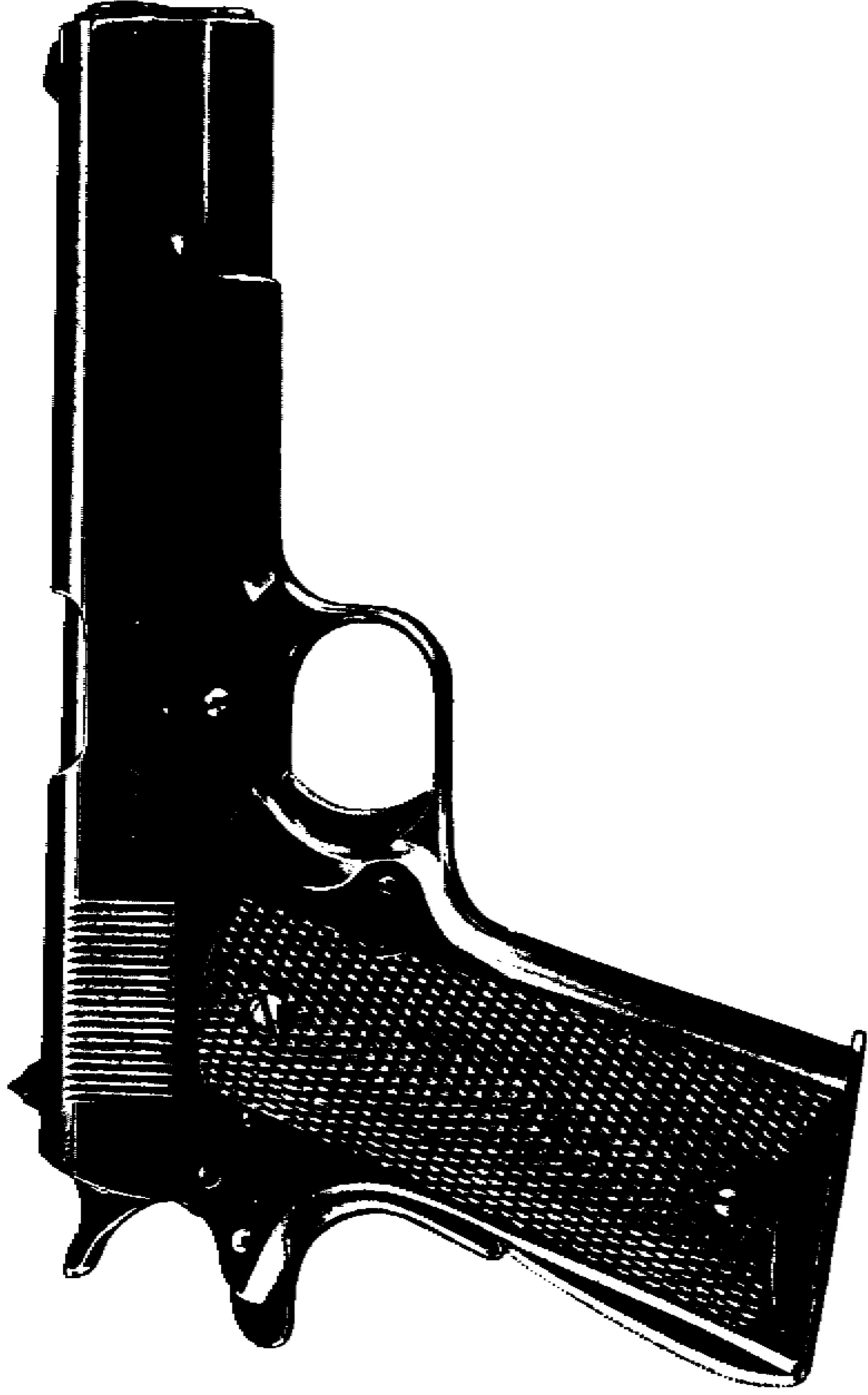
Figure 1 — Right Side of Pistol M1911A1